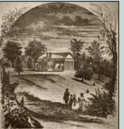
Arlington House, pre-war home of Robert E. Lee.