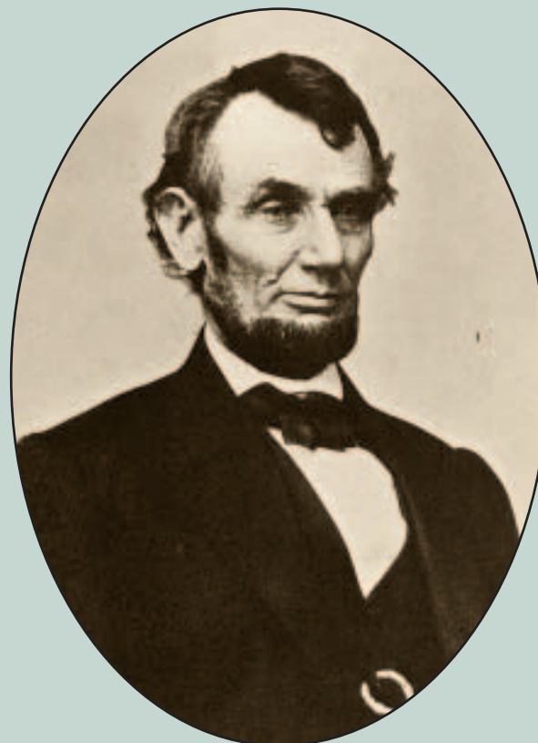
Abraham Lincoln (1809-1865) 16th President of the United States.