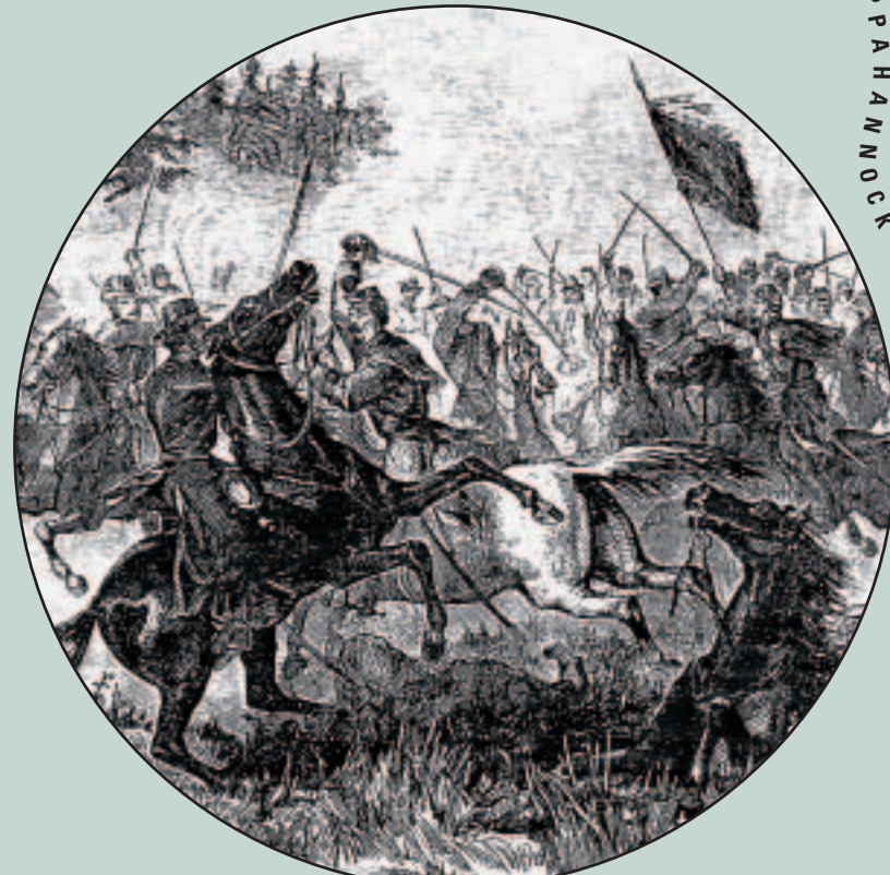
The Kelly's Ford cavalry clash was marked by fierce hand to hand combat. Drawing from Frank Leslie's Illustrated History of the Civil War.