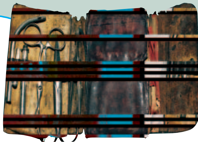
Surgeon's pocket kit, Fort Ward Museum collection.