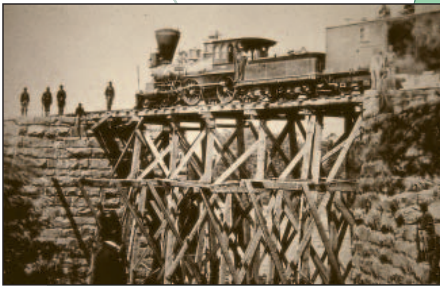
U.S. Military Railroad locomotive Firefly , on the Orange & Alexandria Railroad, ca. 1862.