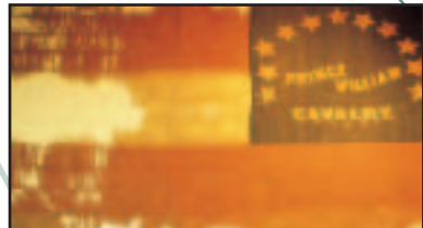
Flag of the Prince William Cavalry (Co. A, 4th Virginia Cavalry).