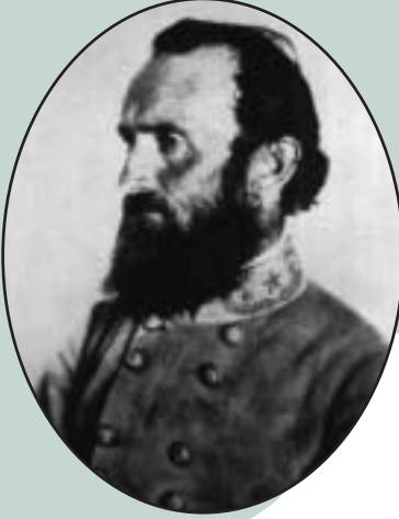
Confederate General Thomas J. "Stonewall" Jackson (1824-1863) earned his famous nickname at the First Battle of Manassas.