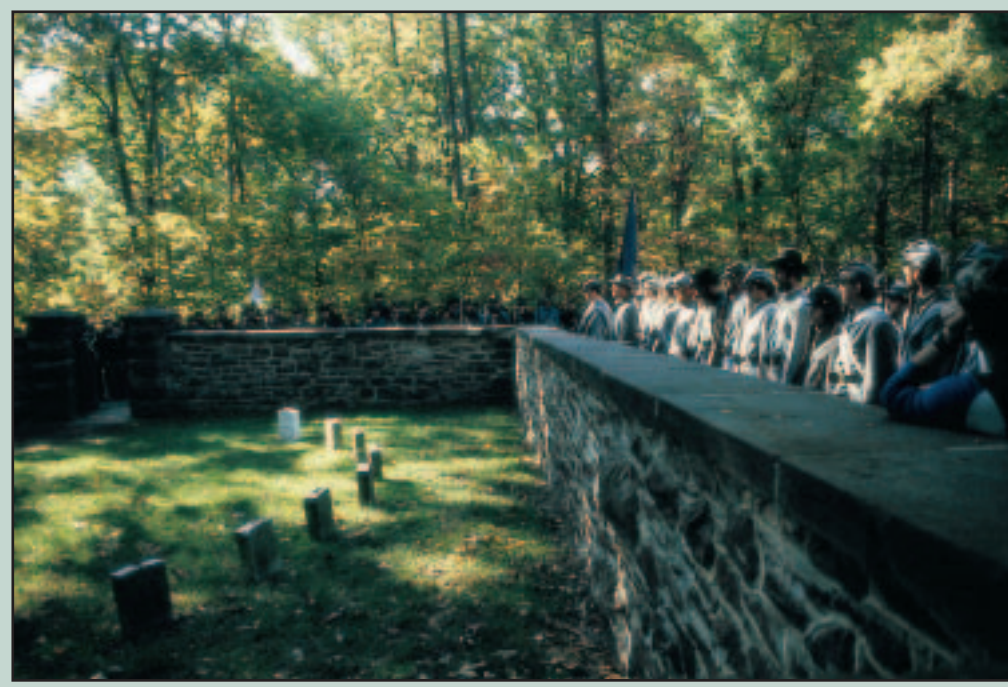
Ball's Bluff National Cemetery, Leesburg.

★ 1865 ★ April 21 Rather than surrender his command to Union forces, Col. John S. Mosby disbands the 43rd Battalion of Virginia Cavalry at Salem (Marshall). May 24 Virginia Governor Francis H. Pierpont leaves Alexandria to establish executive offices in Richmond. July-Oct. The offices of Military Governor and Provost Marshal are abolished in Alexandria, ending military occupation of the city.