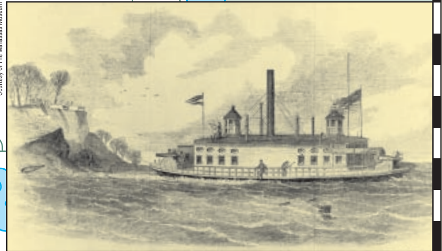
U.S. Navy steamer Wyandank engaging Confederate artillery batteries at Freestone Point on the Potomac River, March 11, 1862.