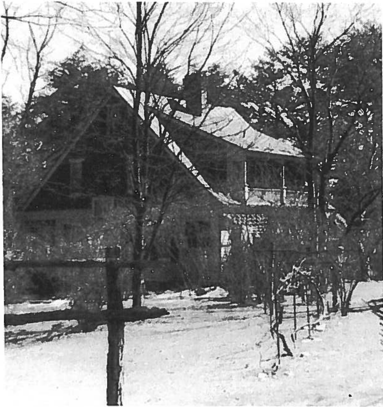
A rear-view winter scene of "Poverty Pines," about 1960.