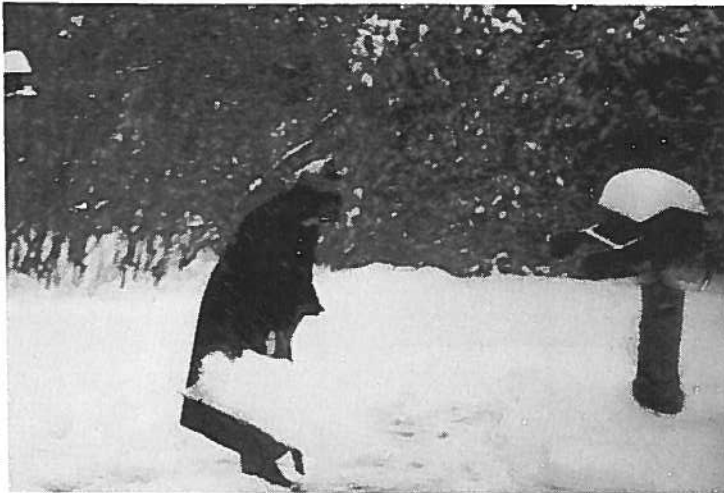
Maude Gage clearing path to bird feeder at "Poverty Pines" during the 1950's.