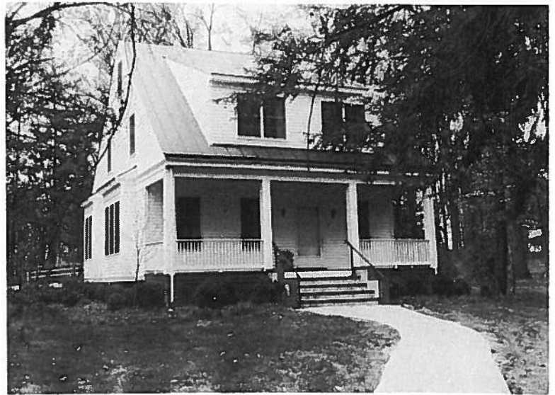
The Falls Church Senior Center.

On the second floor of the Gage House, two rooms are reserved for the Falls Church Historical Commission as places for work, meetings of the commission and for special exhibits on local history.